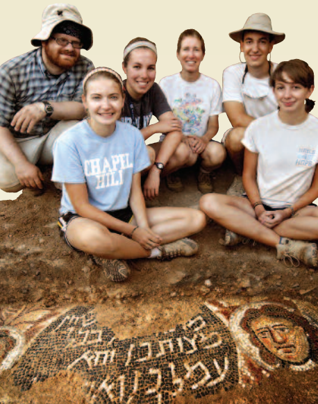
Huqoq