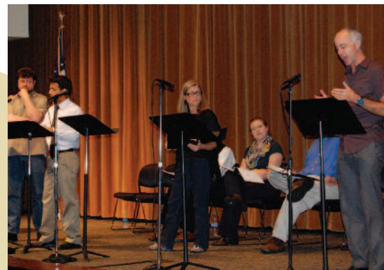
On September 29th, the Center hosted a unique staged reading of Boged: An Enemy of the People . The Center is hosting an expanded public events program this year; please see the back cover for upcoming events.