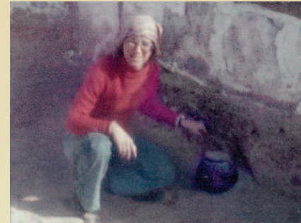
In 1976, with a cooking pot discovered at Qasarwet, in northwest Sinai.