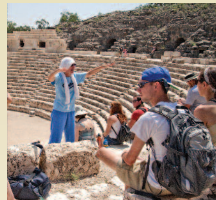
Teaching her students during a field trip to Beth Shean during the Huqoq summer course in 2011.